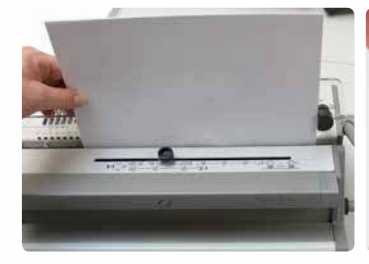
Vertical punching makes it quick and easy to punch correctly every time.