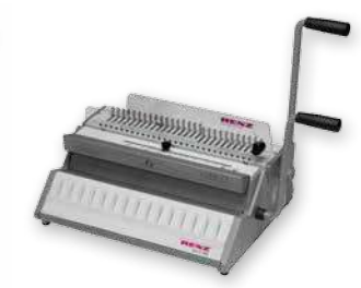
eco S 360

Entry-level office manual punching and binding machine designed for regular use in a small to medium sized office.