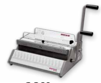
eco C 360 Entry-level office manual punching

Entry-level office manual punching and binding machine designed for regular use in a small to medium sized office.